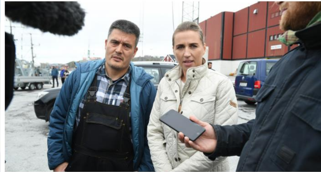
Statsminister Mette Frederiksen (S) og formand for Naalakkersuisut Kim Kielsen (Siumut) satte i dag kurs mod bygden Kapisillit, hvor de skal besøge børn fra børnehjemmet Meeqqat Illuat, der er på lejrtur.

Geopolitisk stormvejr blev i dag afløst af en blikstille sejlads i Nuukfjorden, da statsminister Mette Frederiksen og formand for Naalakkersuisut sejlede til Kapisillit.